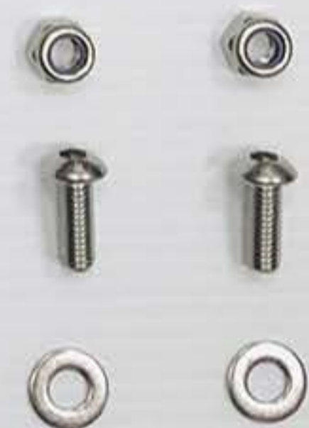
螺帽×2 小螺絲×2 大墊片×2